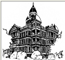
1896- Denton County Courthouse-

The Denton County Genealogical Society meets on the second Thursday during the months on September-November and January-May. 6:30 P.M. Denton Public Library, Emily Fowler Central Library, 502 Oakland St., Denton, TX 76201 www.genealogydentontexas.org