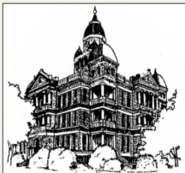
1896- Denton County Courthouse-