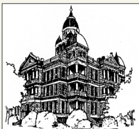
1896- Denton County Courthouse-

The Denton County Genealogical Society meets on the second Thursday during the months on September-November and January-May. 6:30 P.M.