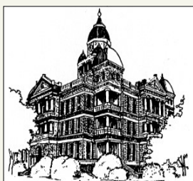
1896- Denton County Courthouse-

The Denton County Genealogical Society meets on the second Thursday during the months on September-November and January-May. 6:30 P.M.